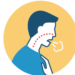
SHORTNESS OF BREATH OR DIFFICULTY BREATHING