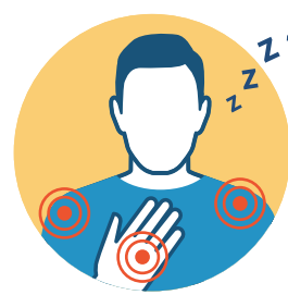
MUSCLE PAIN AND FATIGUE