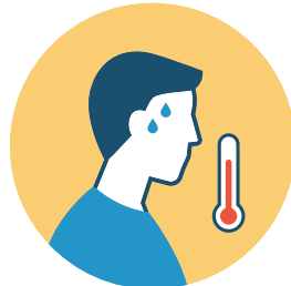
FEVER 100.4* *or school board policy if threshold is lower