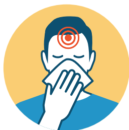
CONGESTION OR RUNNY NOSE